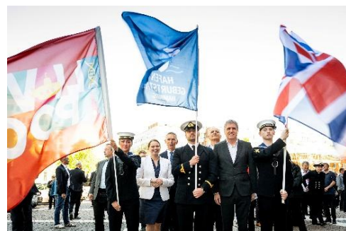
3 sailors from the frigate carried the flags of the UK, Liverpool City Region and HAMBURG PORT ANNIVERSARY followed by the Senator and Metro Mayor

Afterwards Senator Dr. Leonhard and MetroMayor Rotheram started the so called "Parade" from the "Michel" to the museum ship "Rickmer Rickmers" for the official Opening of the HAMBURG PORT ANNIVERSARY followed by the Reception onboard watching the most famous and traditional Incoming Parade of about 250 ships.