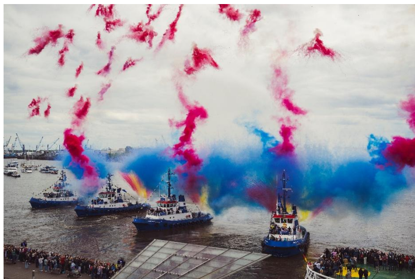
Sunday, May 10th, 2026, in the afternoon, the traditional Tug-boat ballet performed to the music of " You'll never walk alone! "

The HAMBURG PORT ANNIVERSARY reported 1,2 million visitors.