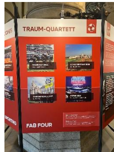
Traum Quartett / Dream Quartet