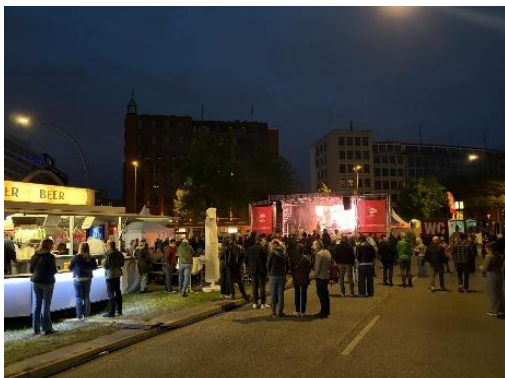
Great atmosphere by night