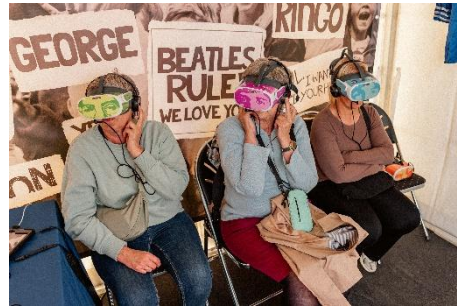
Be a Beatle using the virtual mask