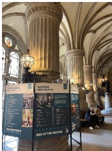
Exhibition in the Rathaus Diele