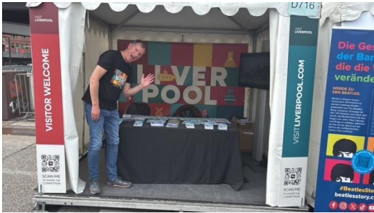
Liverpool City Region

The stands from Liverpool and Liverpool Tourism