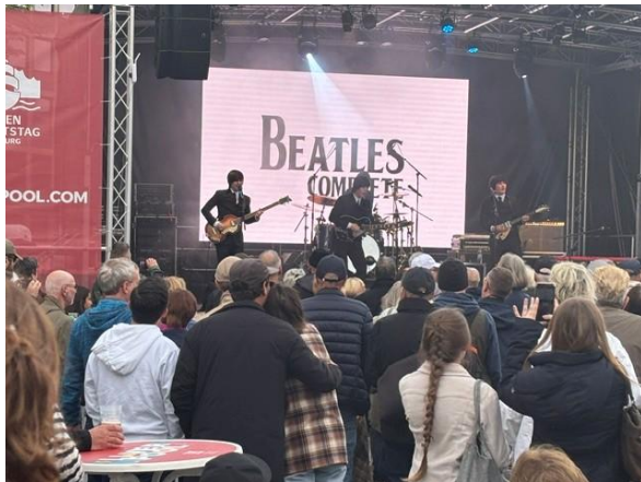
One of THE highlights of the Festival was the final concert of the Beatles Complete in front of an emotional public audience.