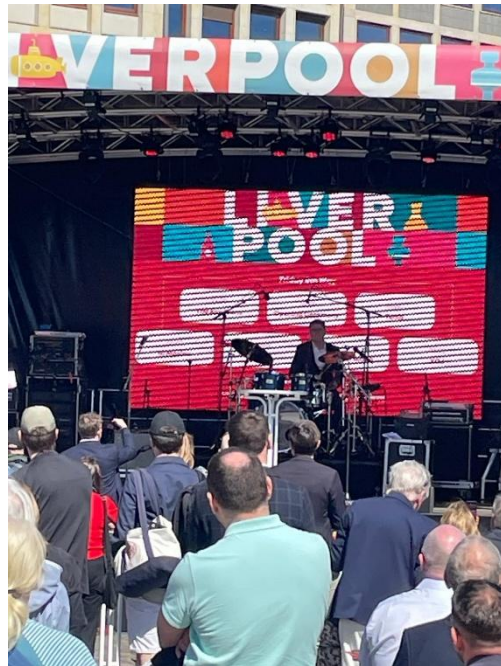
Beginning his speech MetroMayor Steve Rotheram presented a great drum solo on stage