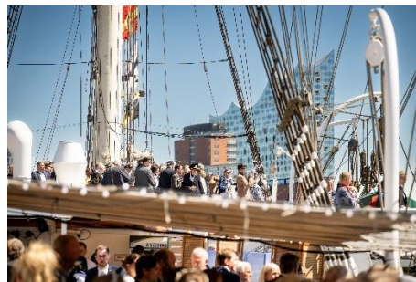
About 700 VIP guests enjoyed the Incoming Parade of about 250 vessels along the Elbe River