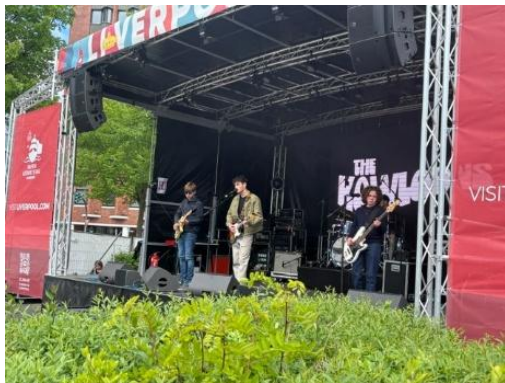
The LCR-Stage – with the performance of the KOWLOONS