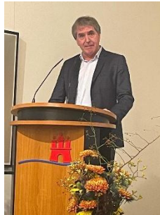
Steve Rotheram, MetroMayor, Liverpool City Region Combined Authorities