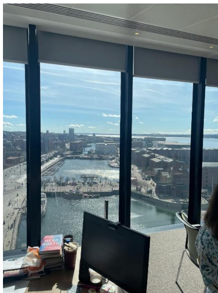
View from the MetroMayor's office