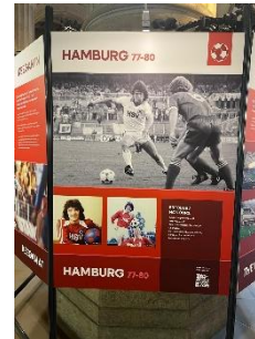
Kevin Keagan in Hamburg (HSV)

“The exhibition "Port Cities: Stages of the World" is being presented in the Main Hall of Hamburg City Hall as part of the Hamburg Port Anniversary. It highlights the historical connection between Liverpool and Hamburg and, until May 26, showcases—for the first time—never-before-seen letters from the five original members of the Beatles”.