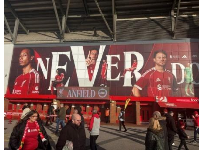
"You never walk alone!"