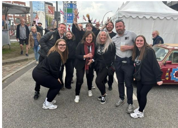
Good bye and thank you Hamburg!

20 flags, United Kingdom and Liverpool City Region, were flying in the wind