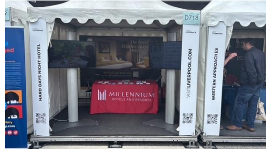
Hard Days Night Hotel