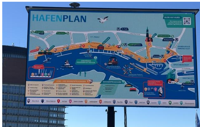
Plan of the 837th HAMBURG PORT ANNIVERSARY on "our" LED-Trailer

The event was totally booked out. Another great success for the partner region, another great Liverpool evening in Hamburg.