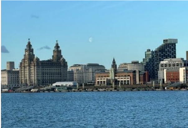
Liverpool Waterfront from the Mersey Ferry