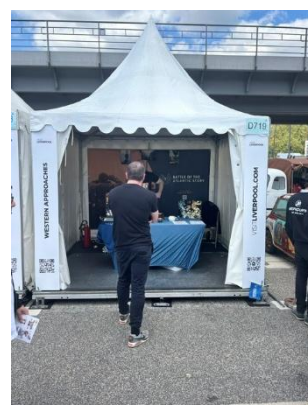
Royal Liver Building 360