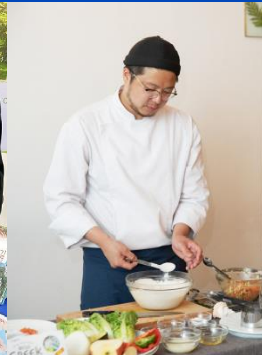
Gourmet City Busan

Playing promotional videos Running promotional activities like flyer distribution and drawing, etc.