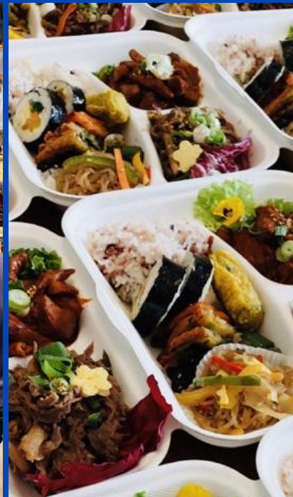
Korean Association in Hamburg

Popular Korean restaurant in Hamburg Selling Korean food