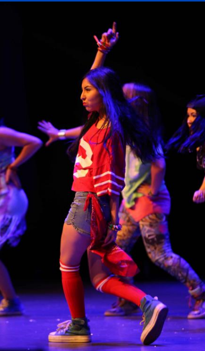
K-Pop Cover Dance

German Dance Teams' K-Pop Cover Performance