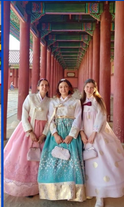
Wearing Korean Traditional Clothes, 'Hanbok'

Experience to wear 'Hanbok' and photo event for anyone who participate in the event