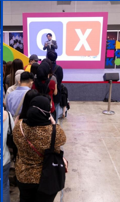
Korea-Busan OX Quiz Game

K-Pop DJ performance, which can make the event enjoy