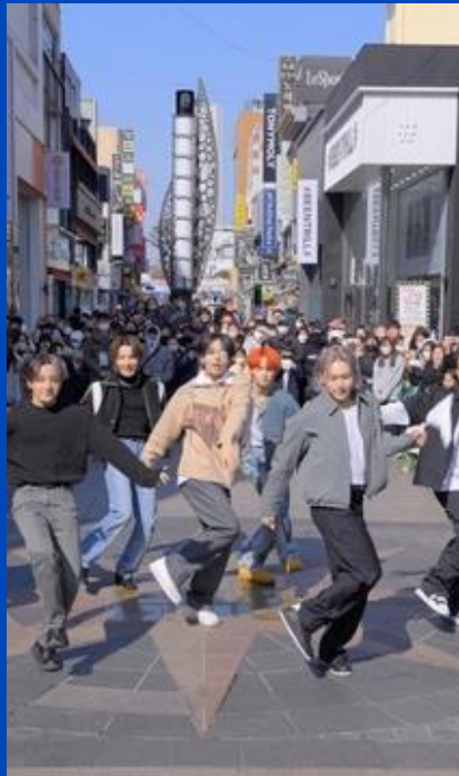
K-Pop Random Play Dance

German Dance Teams' K-Pop Cover Performance