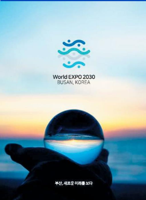
World EXPO 2030 BUSAN, KOREA

Playing promotional videos for EXPO Running diverse events like OX quiz, roulette and drawing, etc.