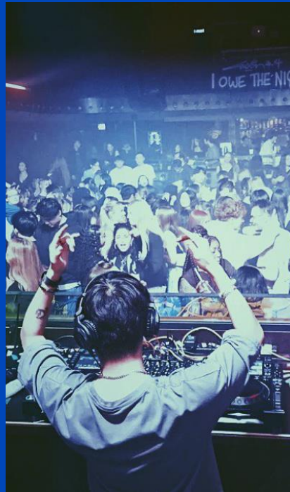
K-Pop EDM DJ

Participative Program, which anyone who know K-Pop can join and dance spontaneously