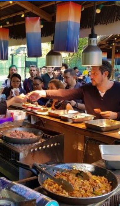
Bok / Wagu Wagu / Kimchi guys

Popular Korean restaurant in Hamburg Selling Korean food