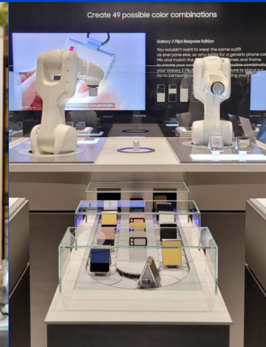
Busan : The city of K-elegance and K-culture

Playing promotional videos Displaying Busan's food (model) Running Cooking class