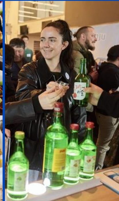
Hamburg Korean Youth Association 'Moinsa'

Selling Korean packed meal like spicy stir-fried pork, bibimbap and bulgogi, etc.