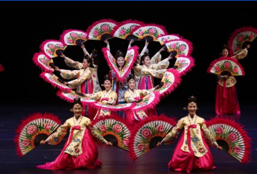
Korean Traditional Music / Dance