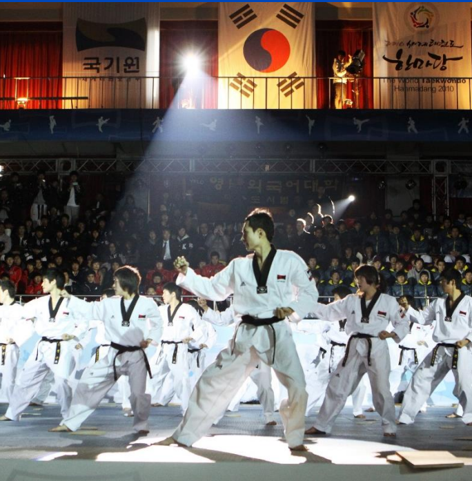
Kukkiwon, Taekwondo Demonstration Team