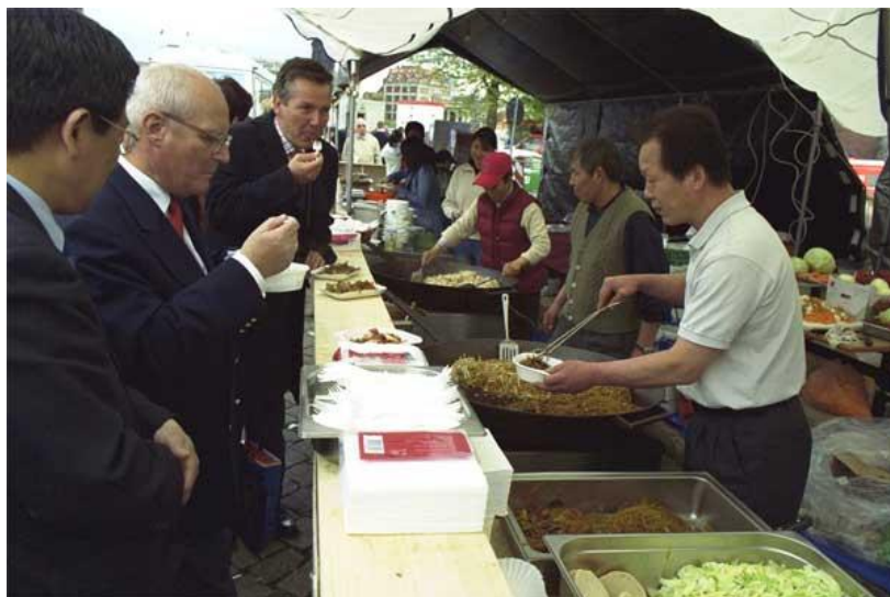
Senator Uldall tasting delicious Korean food