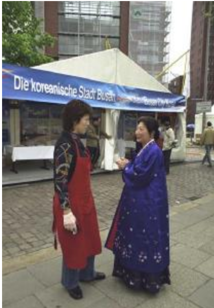
A little Korean chat in between.