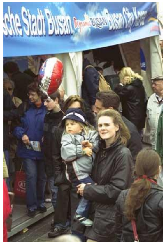
- enjoying young and old!