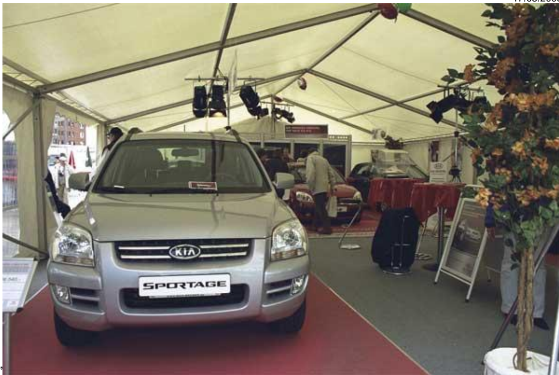
... another peek into the KIA Motors stand!