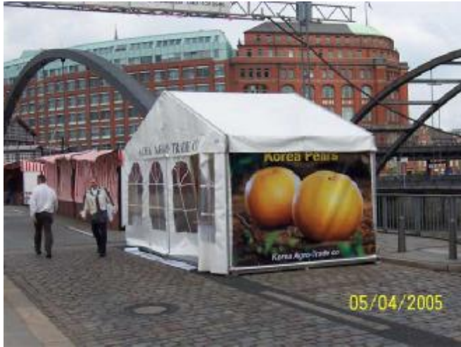
...before the opening..

The booth of Korean Agricultural & Fishery Marketing Corporation