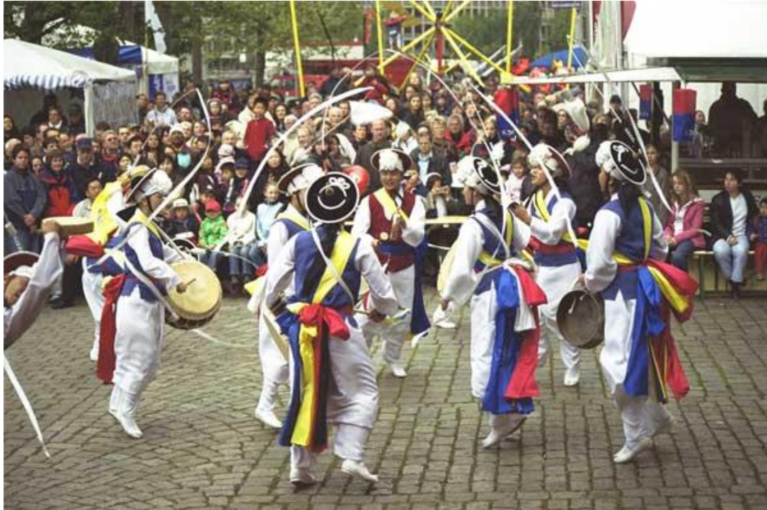
Daily thrilling and enjoyable performances of the Anseong Namsadang Baudeogi Pungmul Troupe