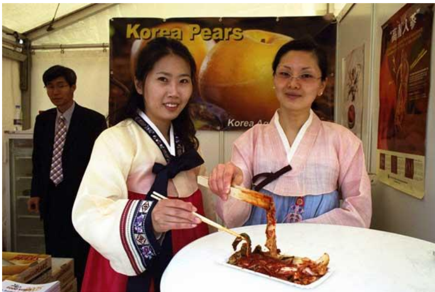
..and delicious Korean KIMCHI! Off course!