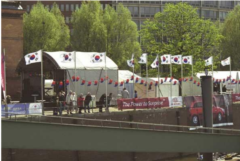
KIA promotion and the presentation of the brand-new RIO was very well visible.