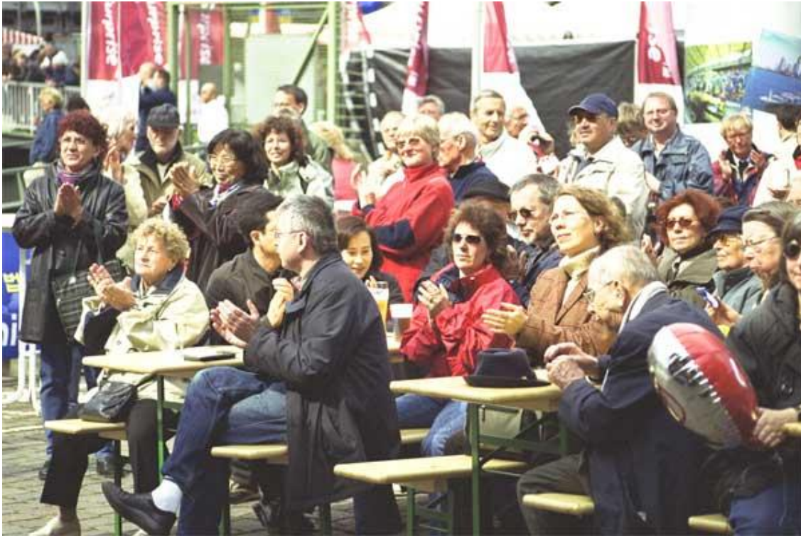
A great audience is following the thrilling action and Korean program on the Korea Stage.