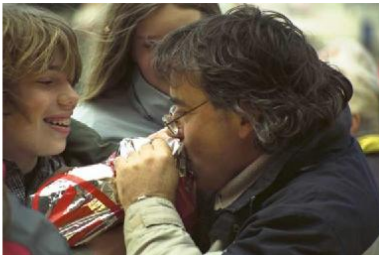
A lot of KIA-balloons have been airflated -