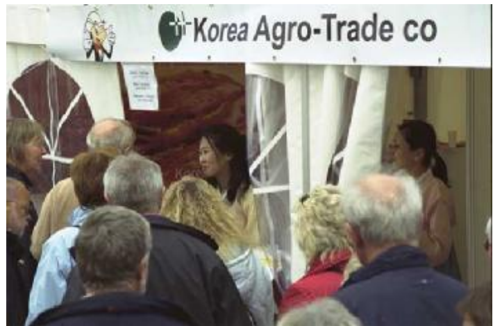
...with people tasting the goods...