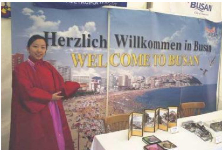
No comment for this photo.